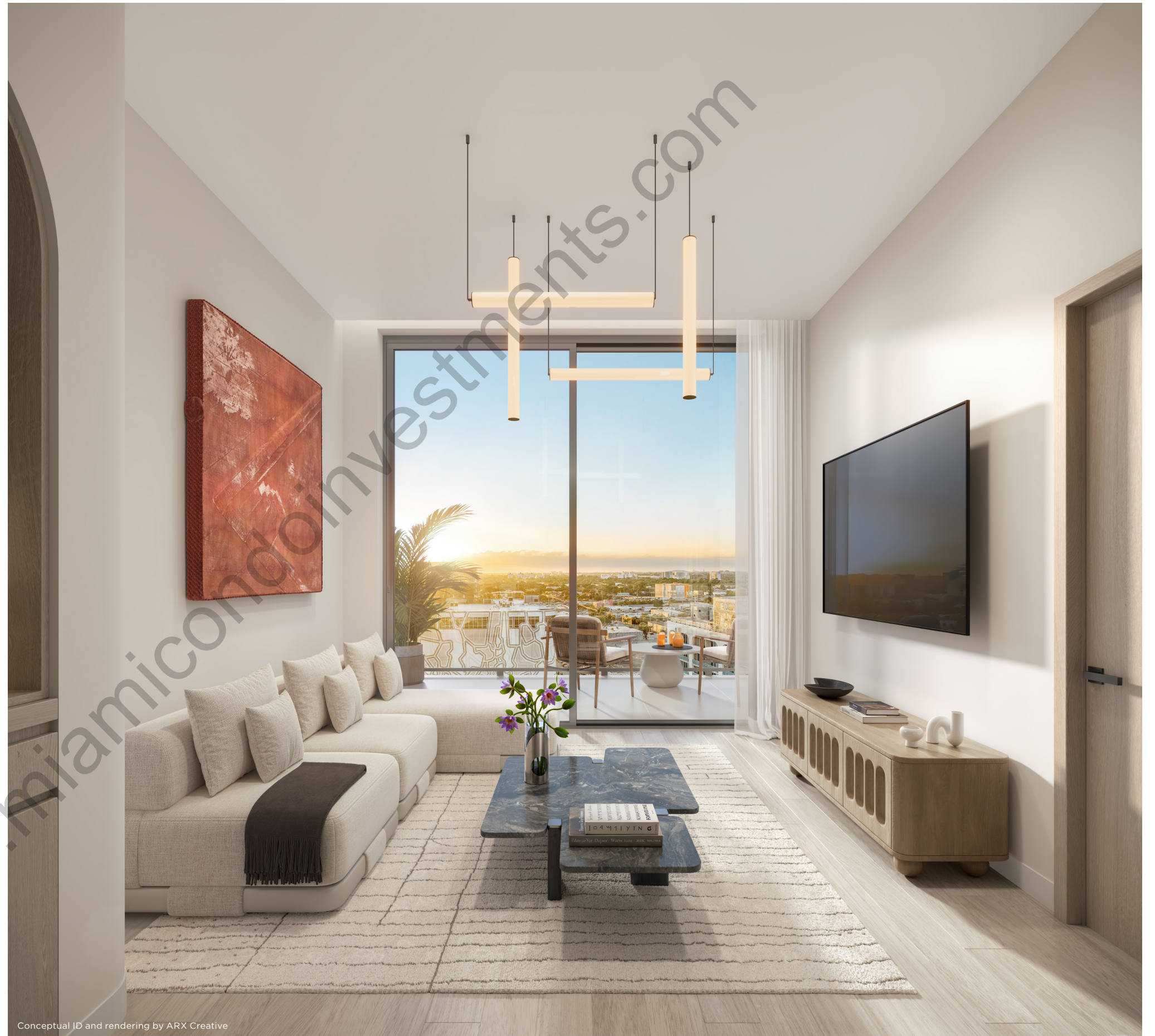
Conceptual ID and rendering by ARX Creative