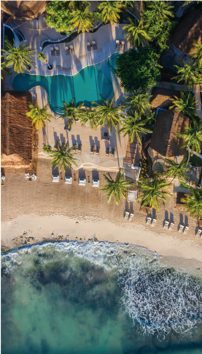
Viceroy Riviera Maya