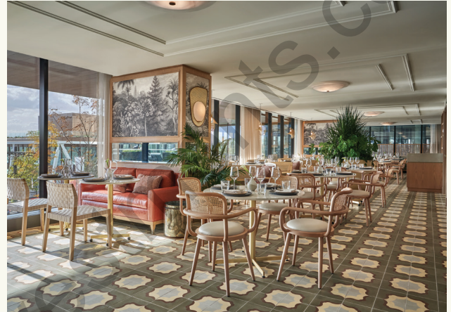
Flora Flora, Washington, DC