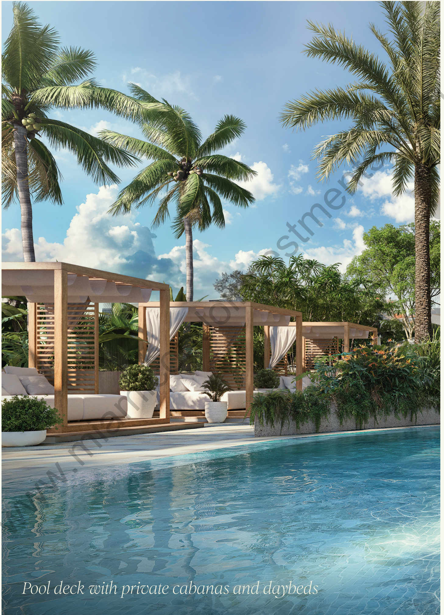
Pool deck with private cabanas and daybeds