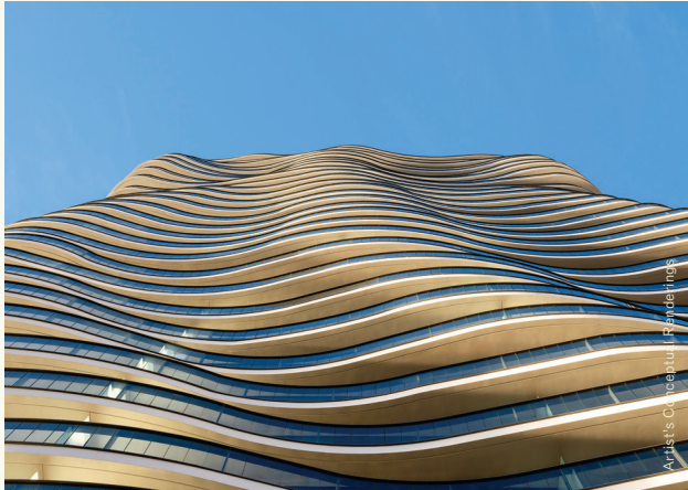
Testimonio II, Monaco