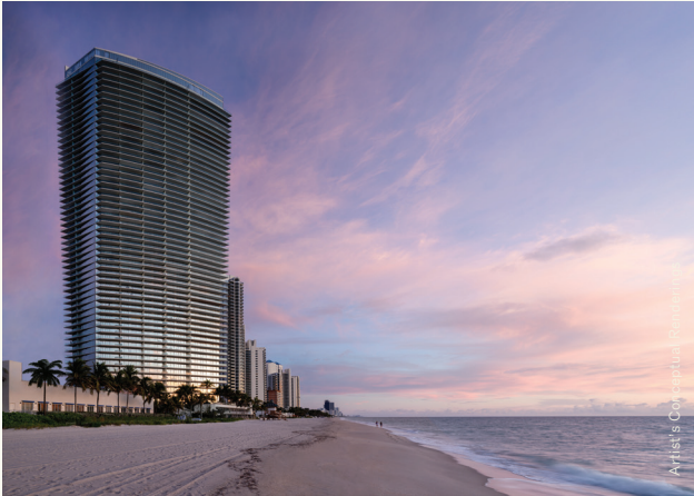
Residences by ARMANI/CASA, Sunny Isles Beach, FL

A breakthrough collaboration of artists, architects, designers, and innovators.