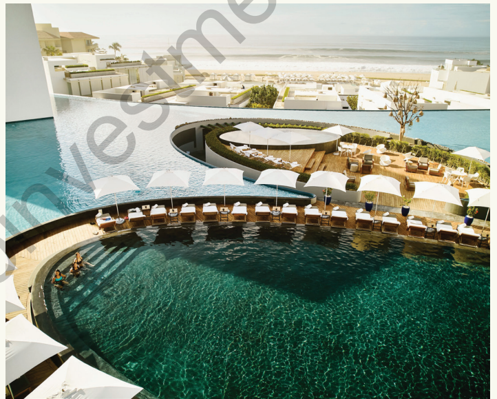
Viceroy Los Cabos