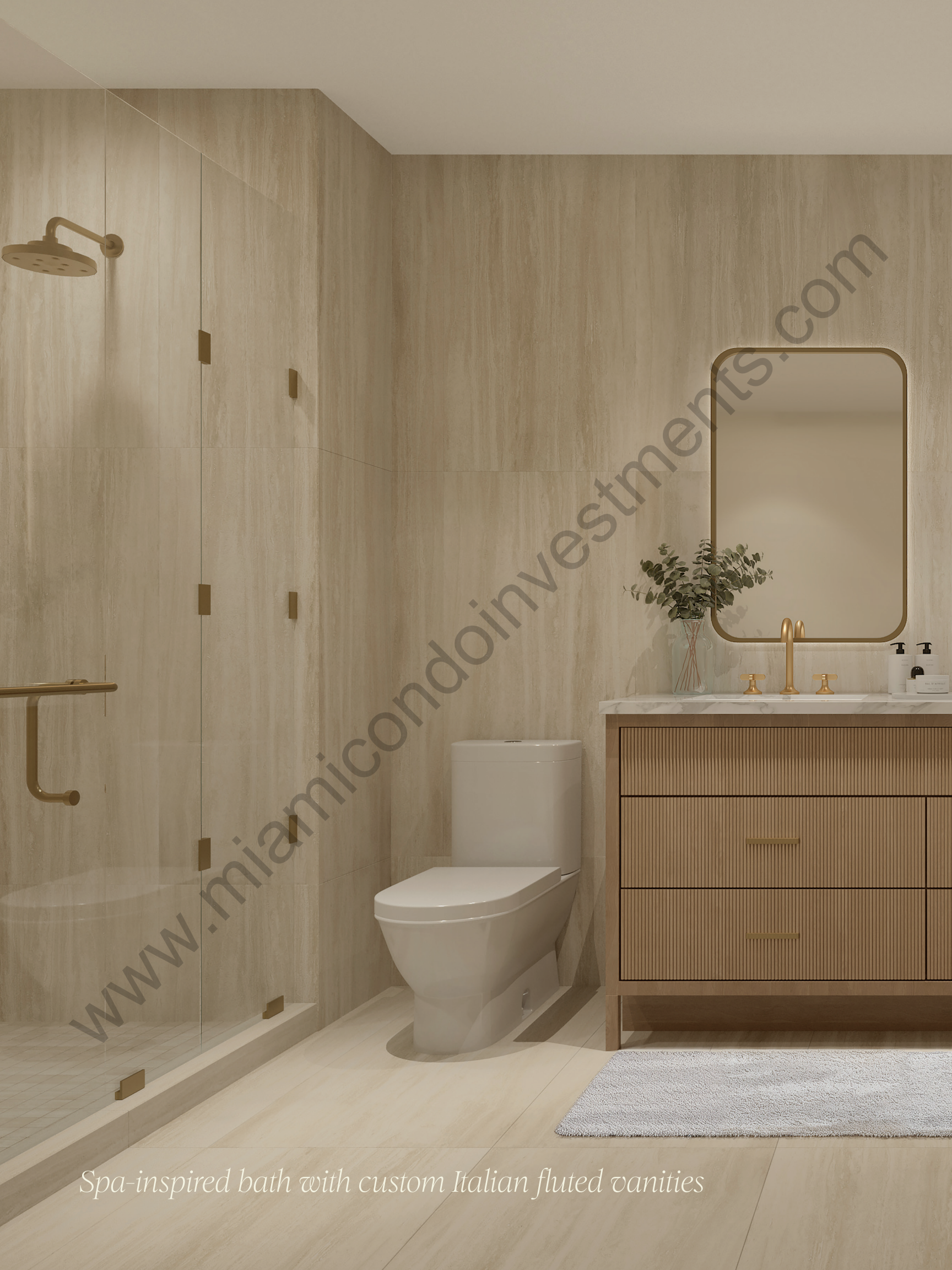
Spa-inspired bath with custom Italian fluted vanities