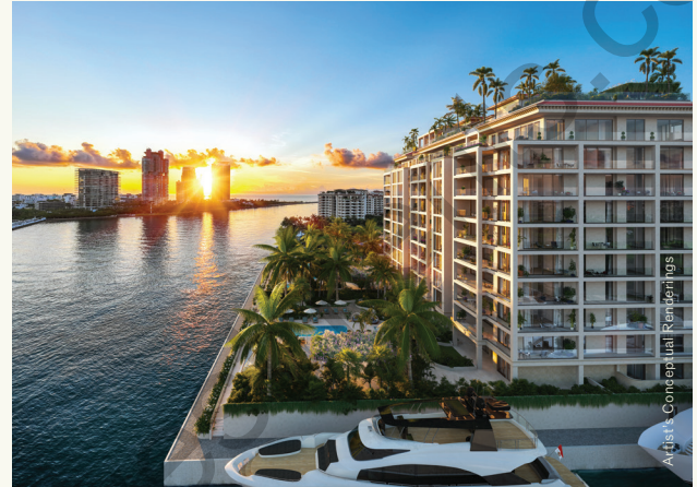
Six Fisher, Fisher Island, FL