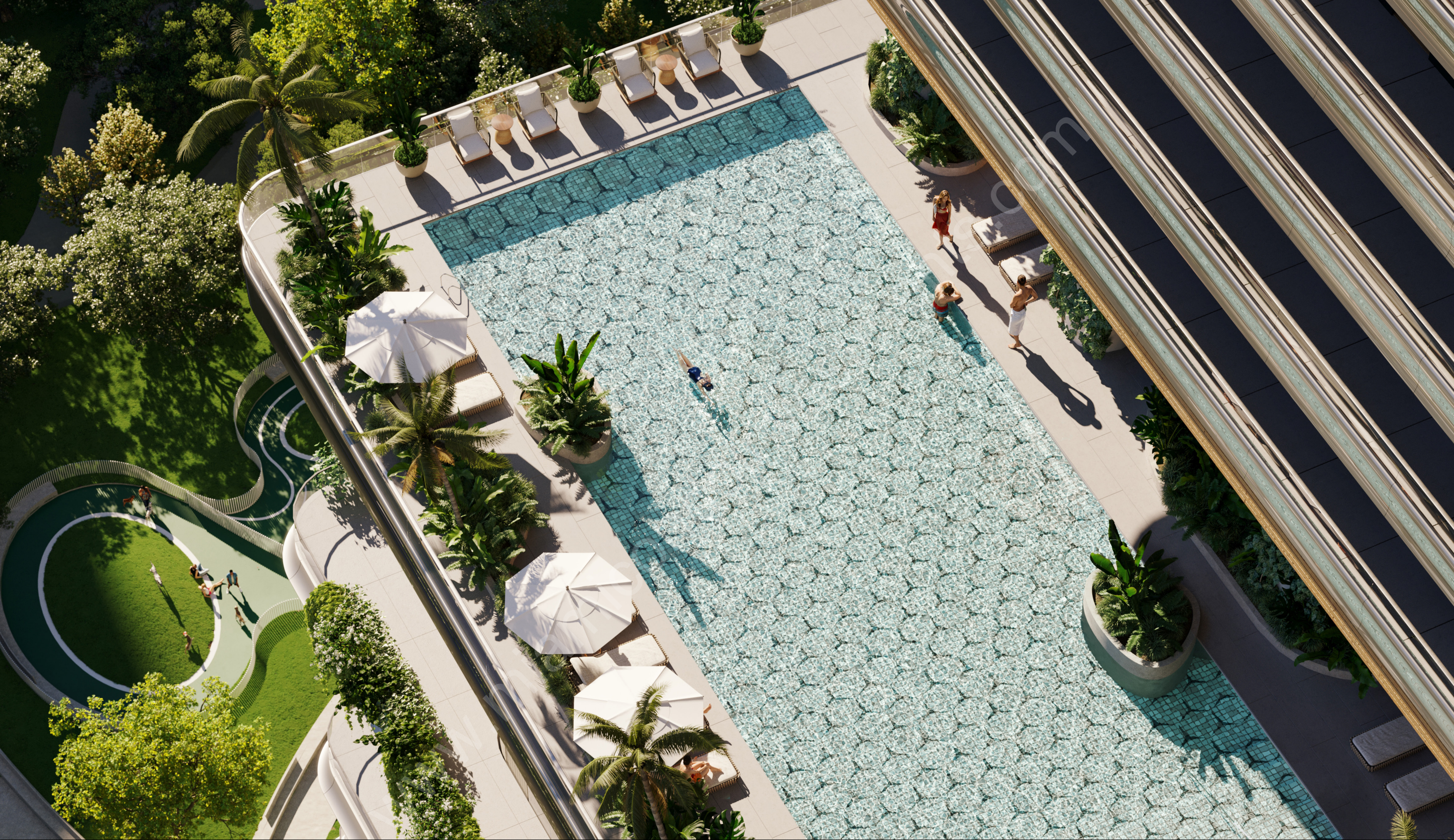
Sun Pool Deck