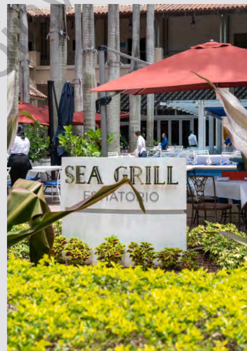
THE SHOPS AT MERRICK PARK