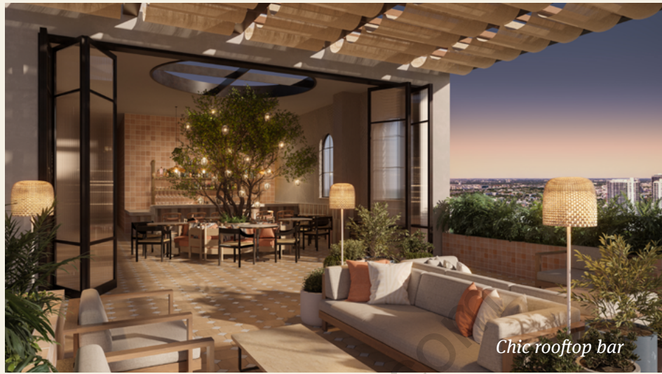
Chic rooftop bar