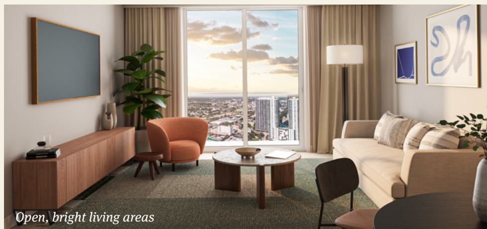
Open, bright living areas