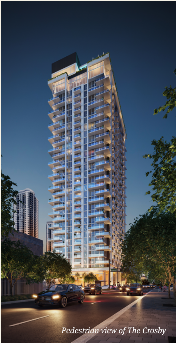
Pedestrian view of The Crosby

The Crosby ushers in a new dynamic Miami lifestyle where the city's best dining, shopping and recreation is just a short walk away.