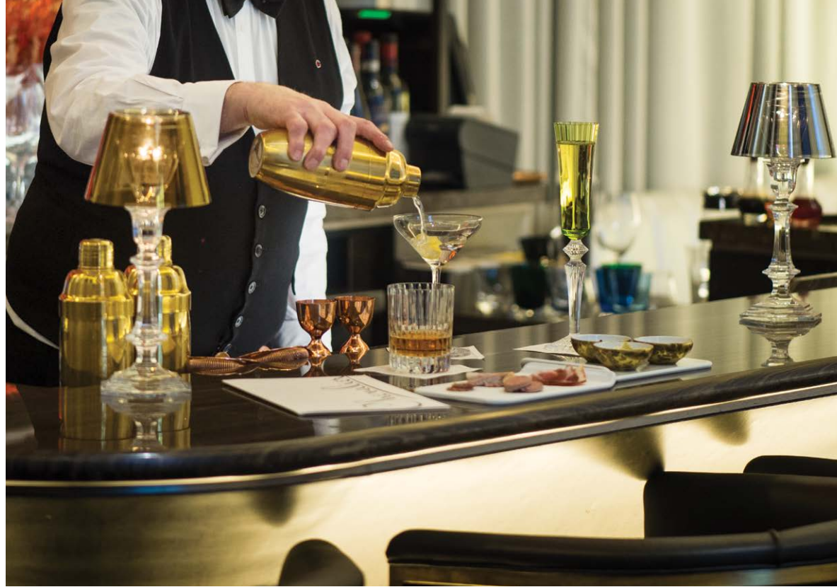
BACCARAT HOTEL NEW YORK

Today, Baccarat continues to celebrate light with shimmering, sensual, and elegant qualities. For over 250 years, Baccarat has pursued and achieved perfection in creating crystal masterpieces. Pushing its heritage of craftsmanship forward, Baccarat creates inspiring architecture and brilliant design, paired with the highest-quality service, to make the finest residences in the world.