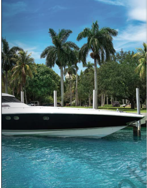
PRIVATE RESIDENTS' WATER TAXI

The private marina, planned riverside restaurant and lushly landscaped river promenade invite residents to spend hours and days luxuriating in the infinite energy and organic sparkle of life by the water. Watch the superyachts come and go, take a sunset stroll towards the bay, or head to a number of chic waterside restaurants courtesy of our private water taxi service. Residents can enjoy private membership and exclusive access to the Beach Club at 1 Hotel South Beach, SH Hotels & Resorts sister property. With loungers, beach towel services, cabanas, and seaside snack and beverage services, this waterfront community will cater to leisurely hours under the sun. Take a break from the hustle and bustle of the city and unwind with a cool drink in hand and the sand between your toes. Perfectly positioned at the entrance of Brickell Avenue, where the Miami River meets the beautiful blue waters of Biscayne Bay, and the bustling financial district blends with high-end shopping, top restaurants, cultural hot spots and exciting nightlife — this iconic neighborhood is an all-day all-night lifestyle destination, aptly named the Manhattan of the South.