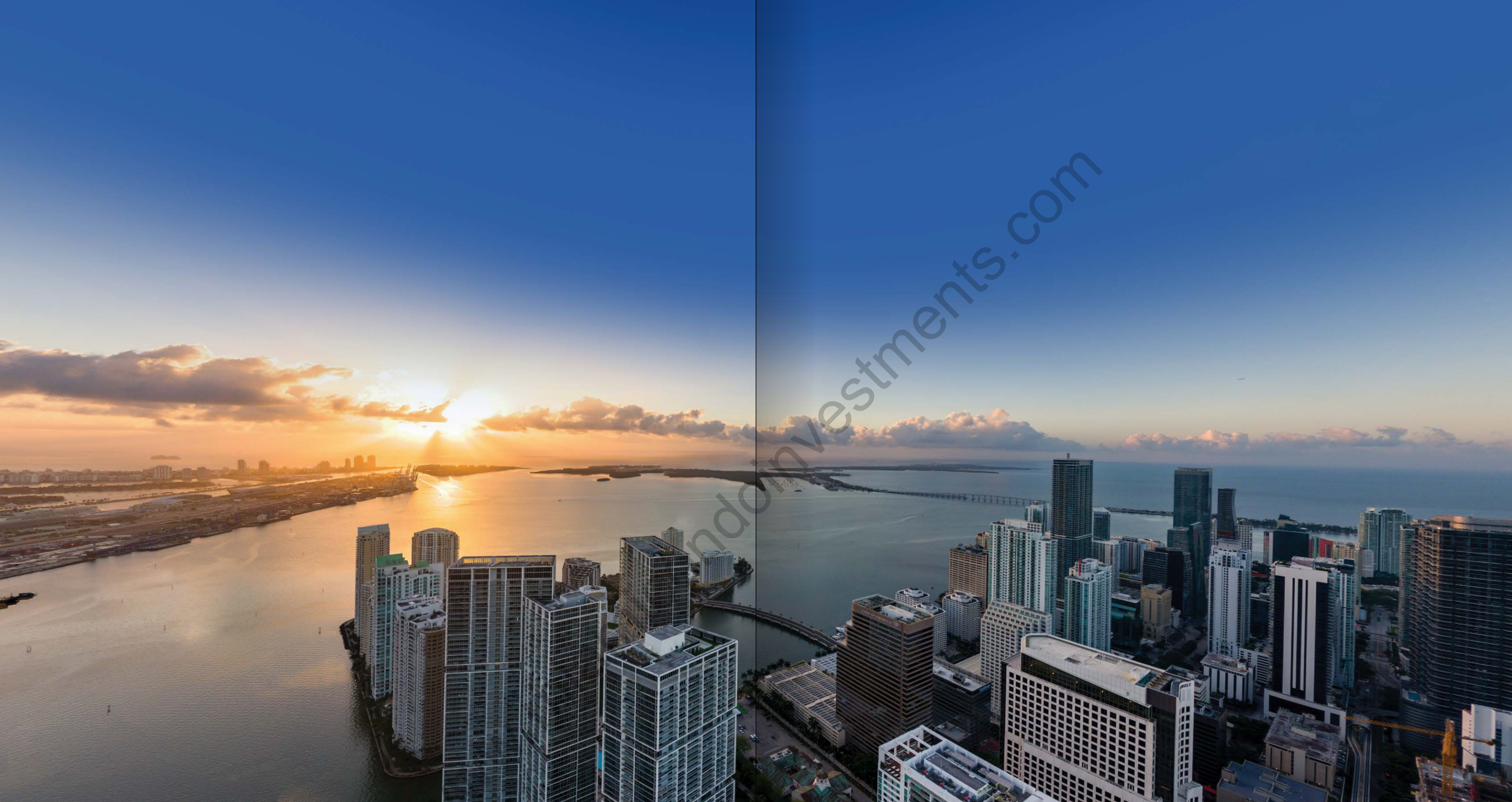
View at Sunrise