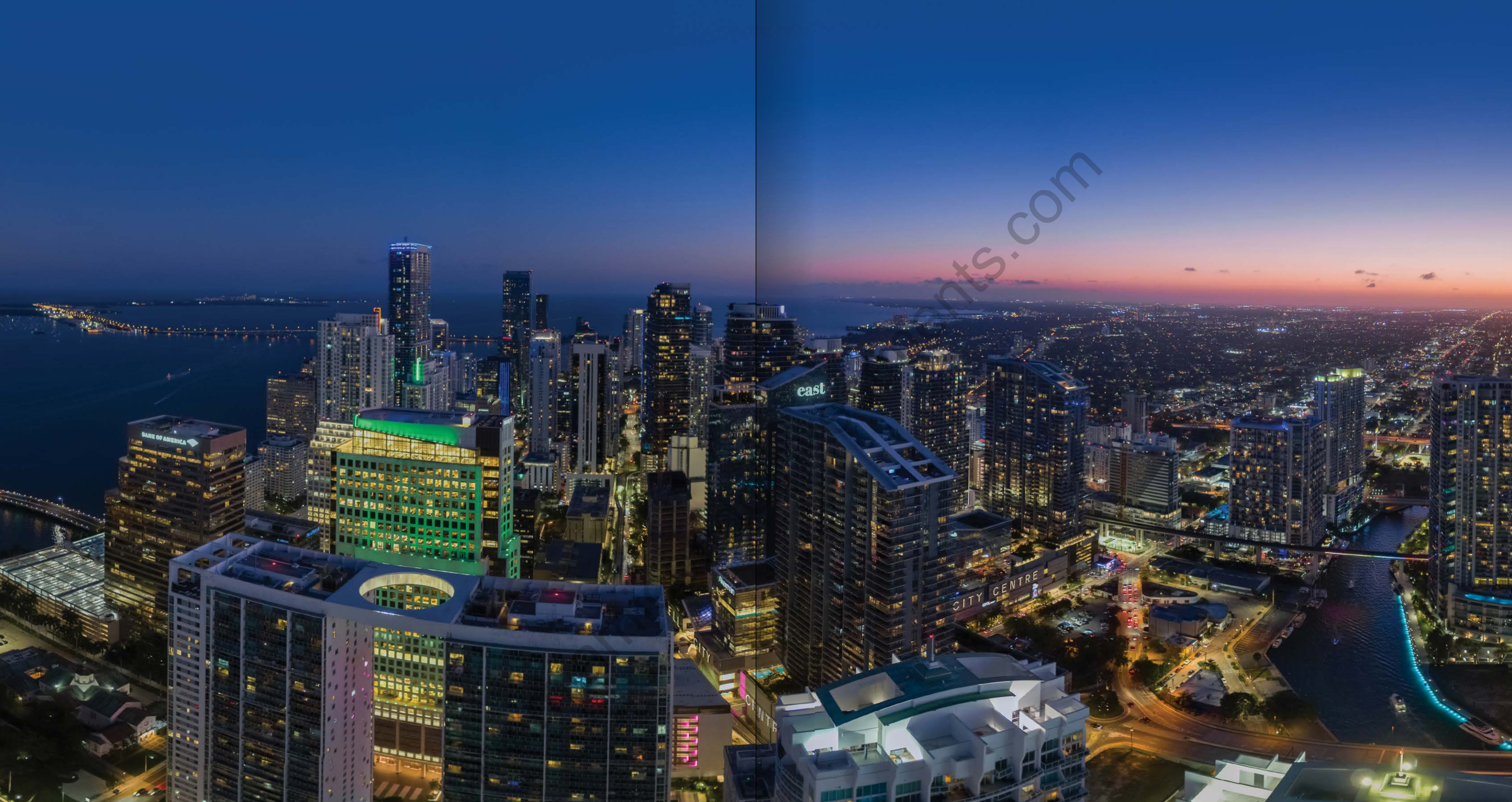
View at Sunset