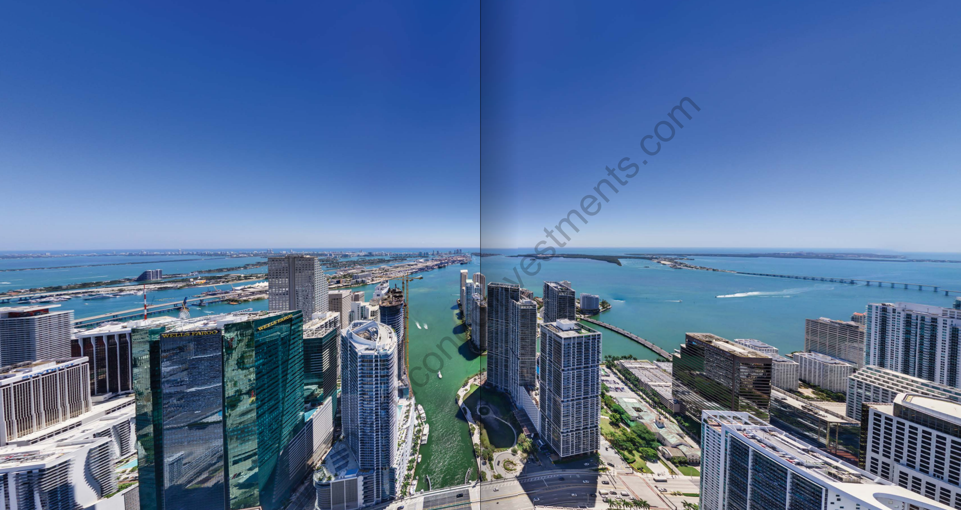
View at Daytime