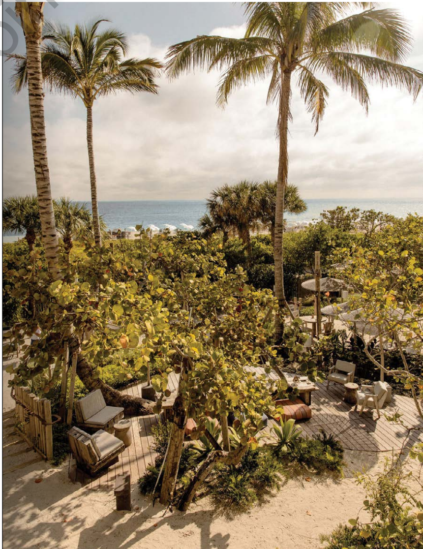
BEACH CLUB AT 1 HOTEL SOUTH BEACH