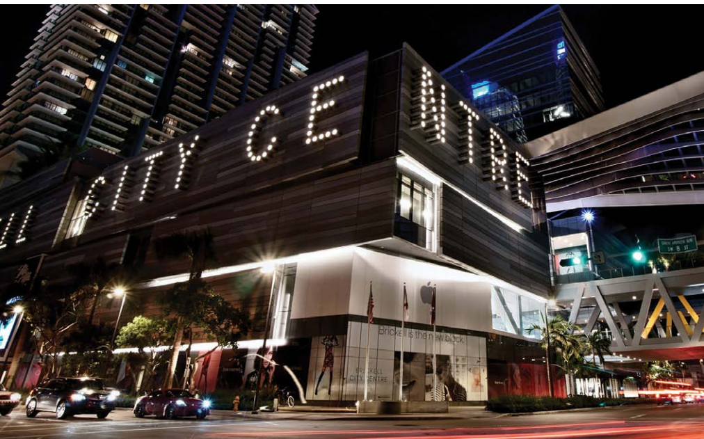
BRICKELL CITY CENTRE

The private marina, planned riverside restaurant and lushly landscaped river promenade invite residents to spend hours and days luxuriating in the infinite energy and organic sparkle of life by the water. Watch the superyachts come and go, take a sunset stroll towards the bay, or head to a number of chic waterside restaurants courtesy of our private water taxi service. Residents can enjoy private membership and exclusive access to the Beach Club at 1 Hotel South Beach, SH Hotels & Resorts sister property. With loungers, beach towel services, cabanas, and seaside snack and beverage services, this waterfront community will cater to leisurely hours under the sun. Take a break from the hustle and bustle of the city and unwind with a cool drink in hand and the sand between your toes. Perfectly positioned at the entrance of Brickell Avenue, where the Miami River meets the beautiful blue waters of Biscayne Bay, and the bustling financial district blends with high-end shopping, top restaurants, cultural hot spots and exciting nightlife — this iconic neighborhood is an all-day all-night lifestyle destination, aptly named the Manhattan of the South.