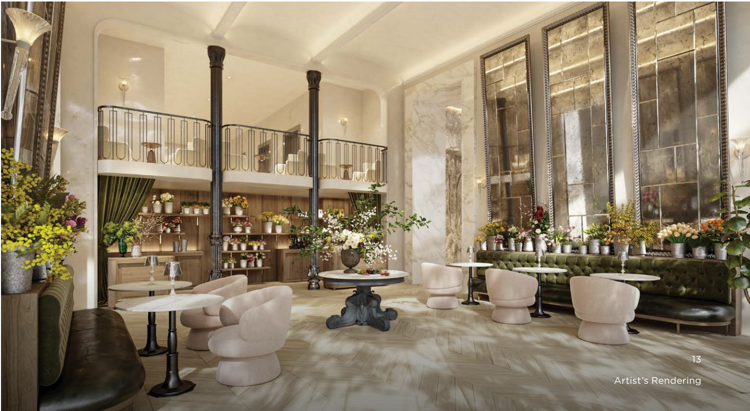
LOBBY CAFÉ AND FLOWER SHOP